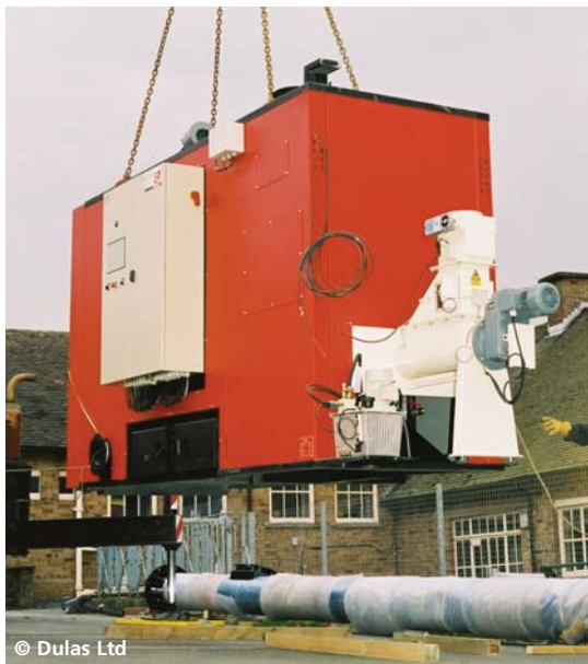
Figure 2: Arrival of boiler at Llanwddyn

The fuel will be delivered to a storage facility located 200 metres from the boiler house where it will be seasoned outside for 12 months, before being chipped for use. It is estimated that two deliveries from the storage facility to the boiler per week will be necessary. These take place in accordance with health and safety procedures and using a high tip trailer drawn by a tractor. The fuel reception is constructed in fabricated steel with a lifting lid.