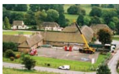
Cover: Arrival of the boiler at Llanwddyn