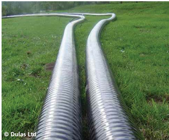
Figure 4: Pipes for heat network

The scheme is not fully operational, as the houses are not yet connected to the heat distribution network. Therefore a full evaluation cannot be made. Powys County Council currently have no plans to replicate this scheme. However they are looking at the feasibility of installing a wood-fired boiler in a leisure centre located close to a school.