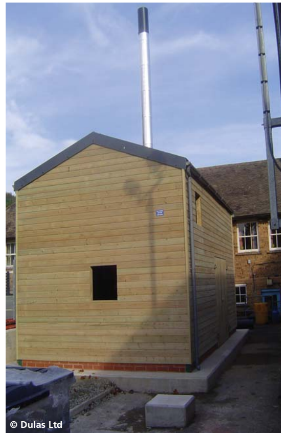
Figure 5: The boiler house